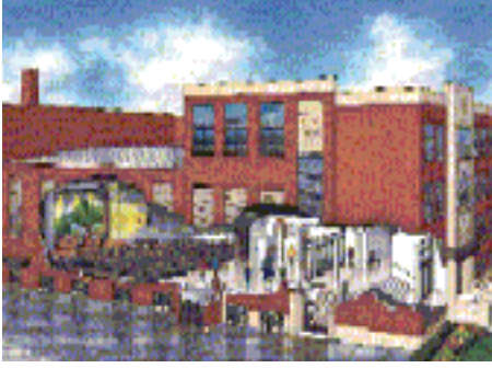
Architectural illustration of Pius XI's proposed new Fr. Robert V. Carney Arts Center